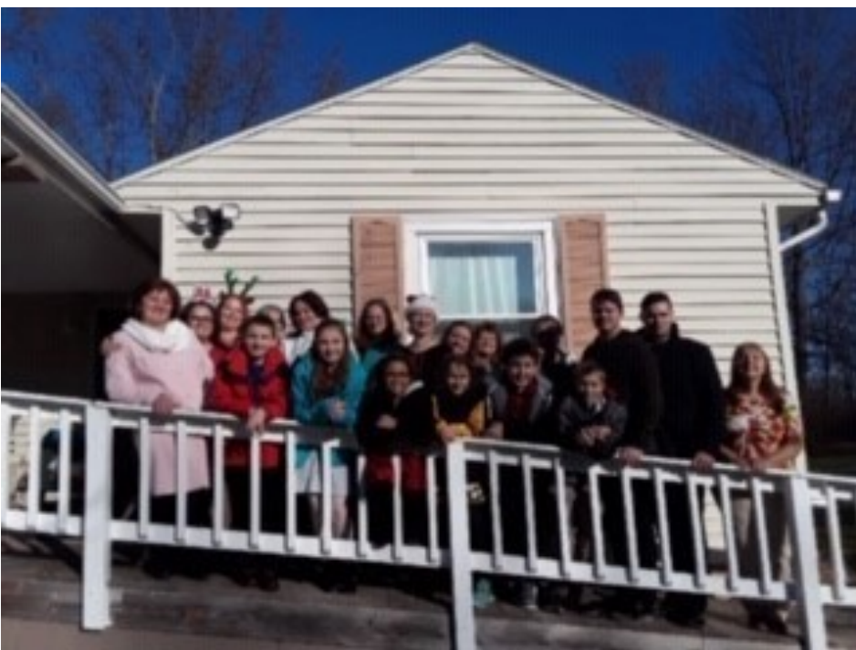
Members of the Junior UOL in Sharon, PA go caroling.