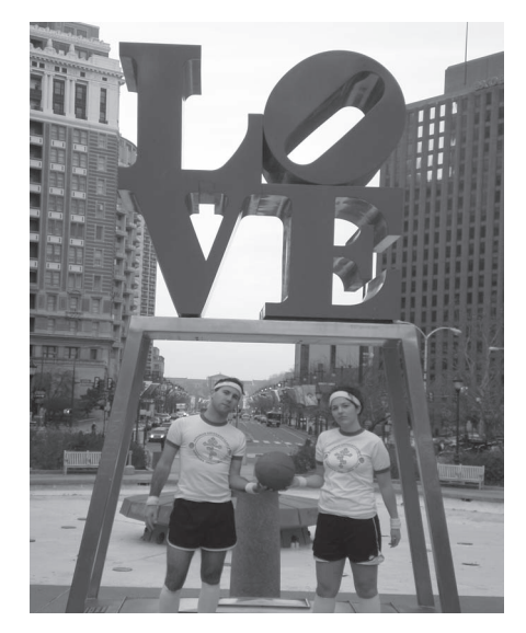
Tipping off in the City of Brotherly Love Philadelphia, PA